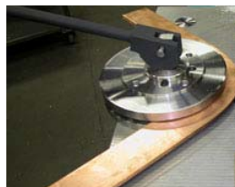
edgewise copper bending