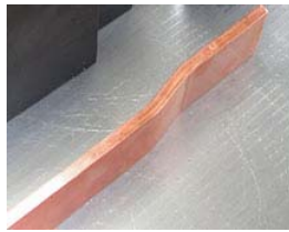
step forming tool