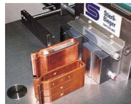
Punching and stamping of copper