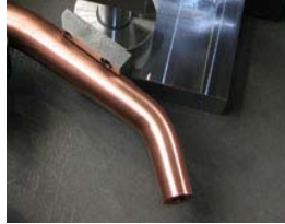
welding electrode bending