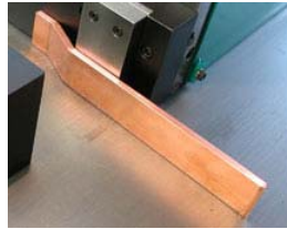
bending of copper bus bars

Convince yourself of the diversity of the bending parts: