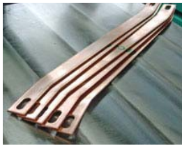
bent after punching