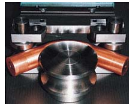
bending of round stock copper