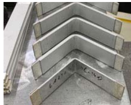
Aluminium bus bar