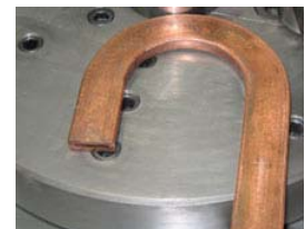
radial bending of copper